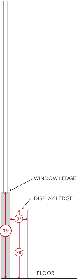
DETAIL OF PROFILE OF DISPLAY LEDGE (MEASUREMENTS APPROXIMATE)