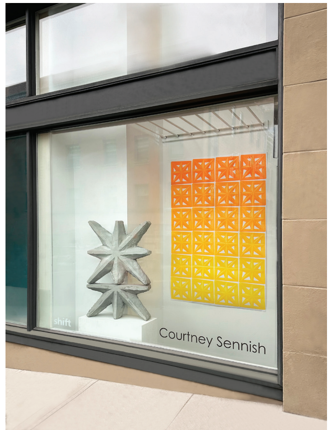
WINDOW INSTALLATION BY COURTNEY SENNISH

312 SOUTH WASHINGTON STREET, SEATTLE WASHINGTON